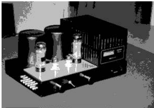
The first amplifier 2-11 A

Each part of our amplifier has been hand built with passion and skill. Our attention to detail will guarantee years and years of trouble free listening.